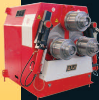
Section rolls – light duty

For information and service “Second to None”