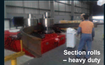
Section rolls – heavy duty

For information and service “Second to None”