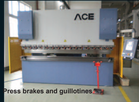
Press brakes and guillotines