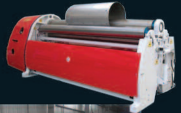
Plate rolls – light duty