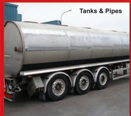
Tanks & Pipes