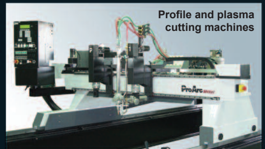
Profile and plasma cutting machines