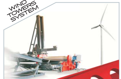
WIND TOWERS SYSTEM

Davi is the market leader worldwide in the manufacture bending machines including plate rolls, wind tower lines, beam benders and folding machines.